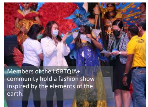
Members of the LGBTQIA+ community hold a fashion show inspired by the elements of the earth.