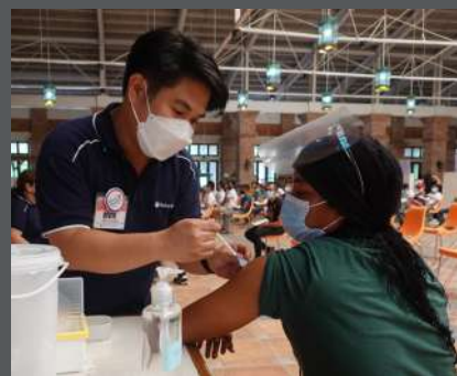
SMPC pinaigting ang kaligtasan ng empleyado kontra COVID-19