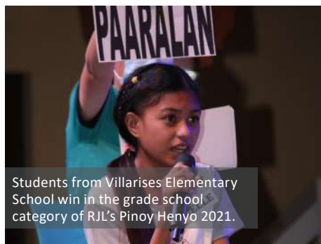
Students from Villarises Elementary School win in the grade school category of RJJ's Pinoy Henyo 2021.