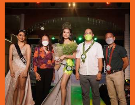
Pagkalinga at pagkakaisa, tunay na diwa ng Pasko sa Semirara