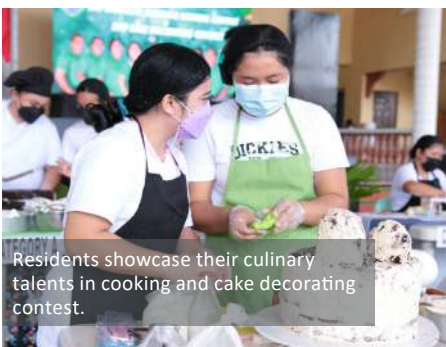
Residents showcase their culinary talents in cooking and cake decorating contest.