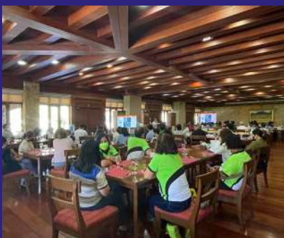
Year-end stakeholder report and thanksgiving