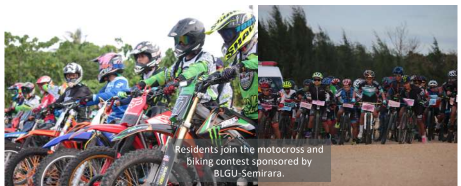
Residents join the motocross and biking contest sponsored by BLGU-Semirara.