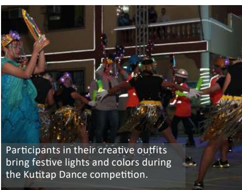
Participants in their creative outfits bring festive lights and colors during the Kutitap Dance competition.