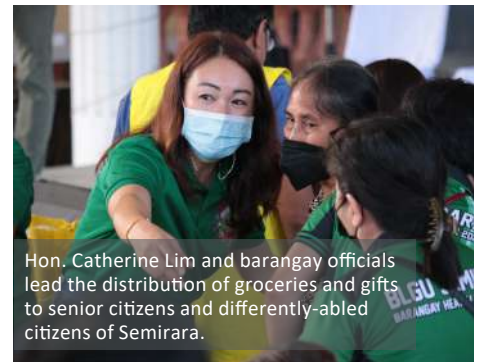
Hon. Catherine Lim and barangay officials lead the distribution of groceries and gifts to senior citizens and differently-abled citizens of Semirara.

Indeed, it was a blessed, notable, and successful Christmas celebration of Barangay Semirara. As we share love, peace, joy and unite for the coming year, may we also continue to live life to a progressive Semirara.